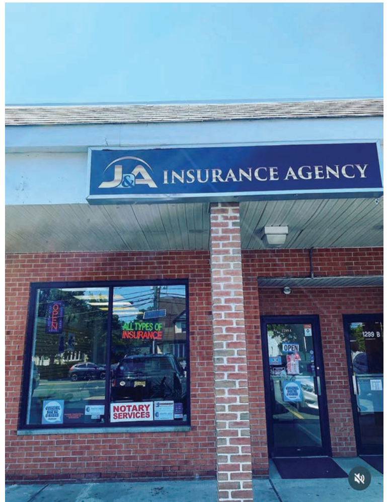
J&A Insurance Agency is a minority woman-owned business based in West Carteret.

“Providing clients with the right insurance coverage can offer peace of mind and assistance during challenging times,” she said. “Also, establishing long-term relationships with clients is very fulfilling. Being there for clients throughout various life stages and helping them navigate changes in their insurance needs can lead to a strong sense of connection