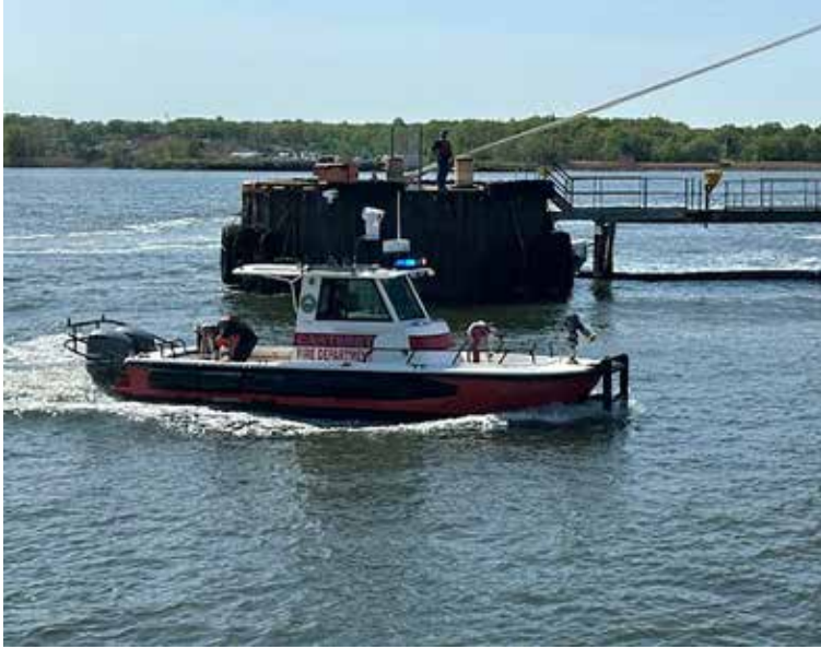
PHOTO GALLERY: Carteret Fire Marine Unit Participates in Port Training